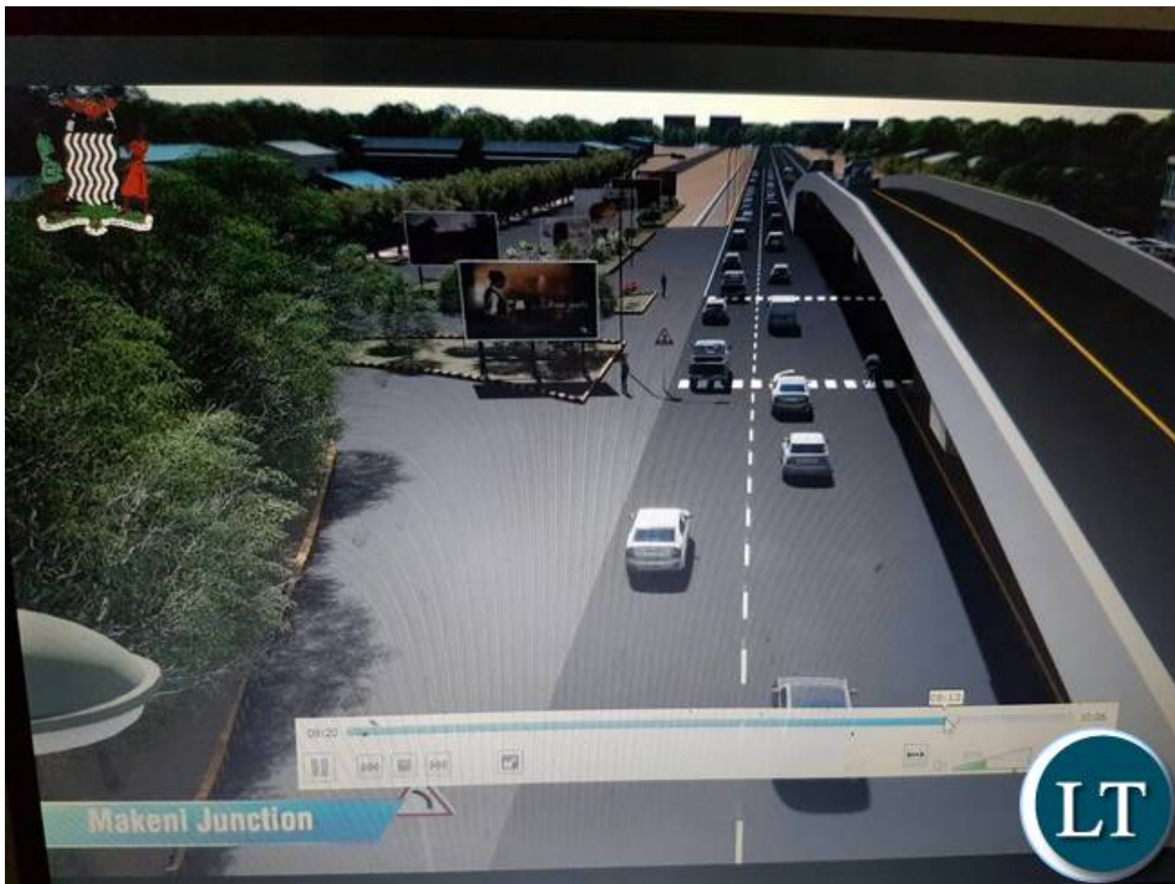
An Artist impression of the Lusaka Decongestion Project (LDP)